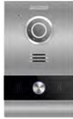
MILO 1W PANEL