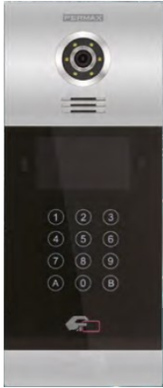
MILO DIGITAL PANEL