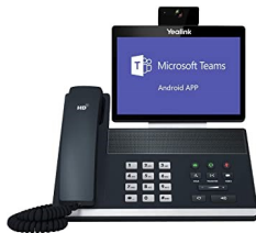
SIP AUDIO/VIDEO PHONE COMPATIBLE WITH TEAMS APP