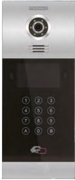
PLACA MILO DIGITAL