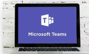
TEAMS APPS IN DESKTOP PC OR SMARTPHONES