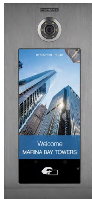
PLACA KIN TACTIL