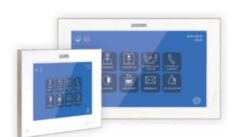
WIT 7" Y 10" INDOOR MONITORS