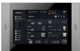
ASTRUM INSPINIA TOUCH SCREEN