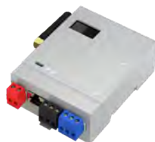
ASTRUM INSPINIA MINI SERVER