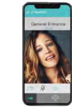
MEET ME CALL DIVERT