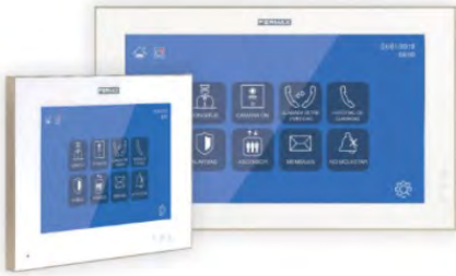
WIT 7" Y 10" INDOOR MONITORS