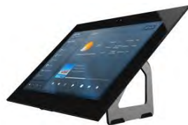
RTI TOUCH PANEL