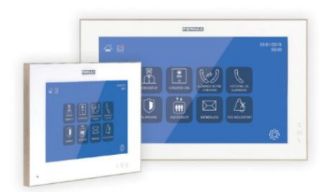
WIT 7" Y 10" INDOOR MONITORS